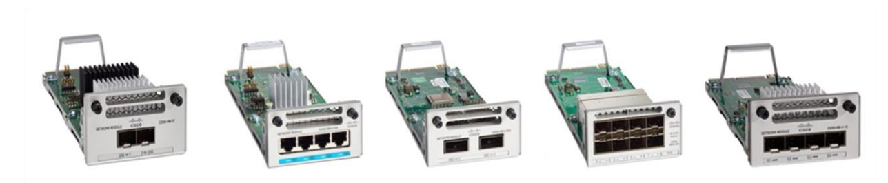
Figure 3. Cisco Catalyst 9300 Series Network Modules