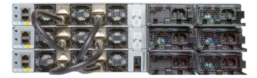
Figure 6. Cisco Catalyst 9300 Series fixed uplink models with optional stack kit