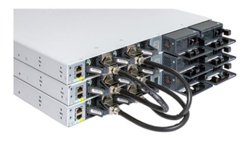
Figure 5. Cisco Catalyst 9300 Series modular uplink models stack (C9300/C9300X SKUs) and fixed uplink models stack (C9300L SKUs)