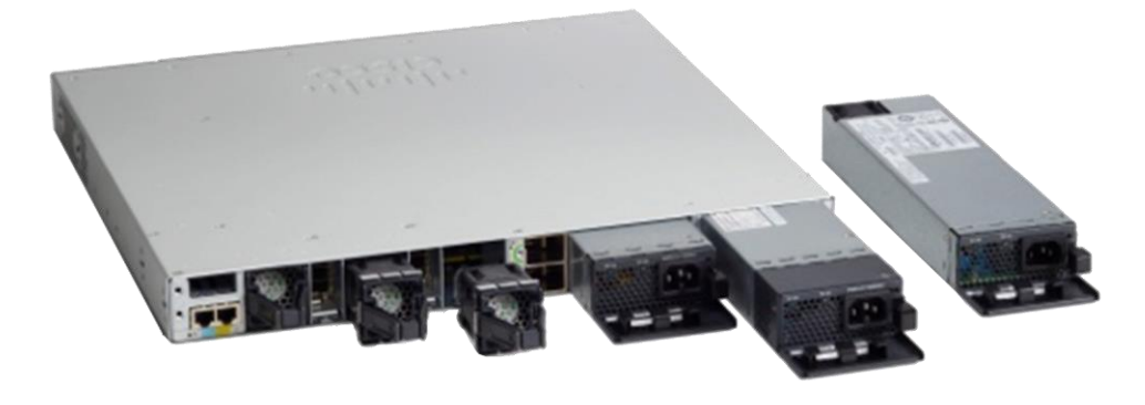
Figure 4. Cisco Catalyst 9300 Series Dual Redundant power supplies

Cisco Catalyst 9300 Series switches support dual redundant power supplies. The switches ship with one power supply by default, and the second power supply can be purchased when the switch is ordered or at a later time. If only one power supply is installed, it should always be in power supply bay #1. The switches also ship with three field-replaceable fans. Power Supplies are common across the Catalyst 9300 Series.