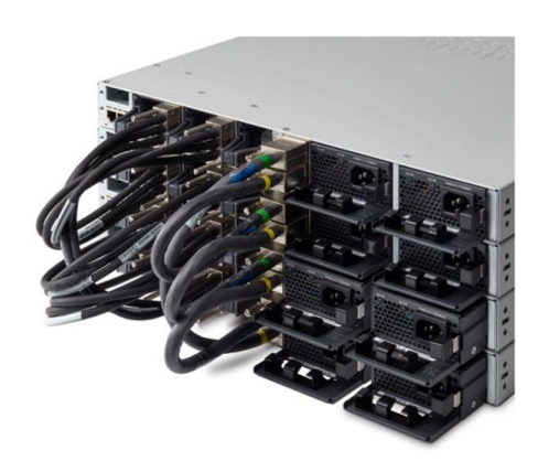
Figure 7. Cisco Catalyst 9300 Series StackPower